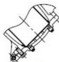
SIZE 8 & LARGER